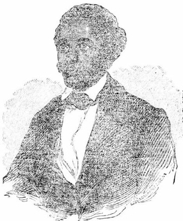
STEPHEN ALLEN BENSON, from Maryland, Second President of Liberia, elected for two terms of two years each.