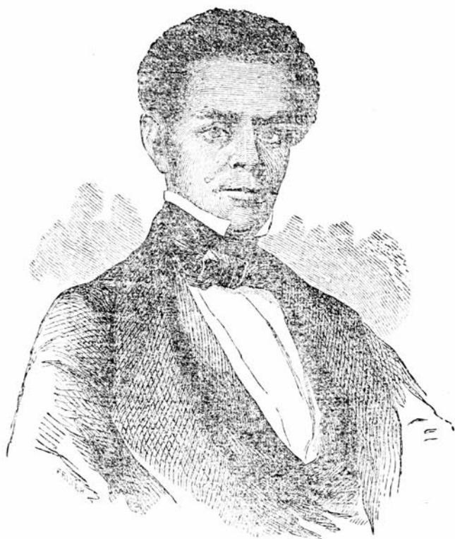
JOSEPH JENKINS ROBERTS, from Virginia, First President of Liberia, elected for four terms of two years each.